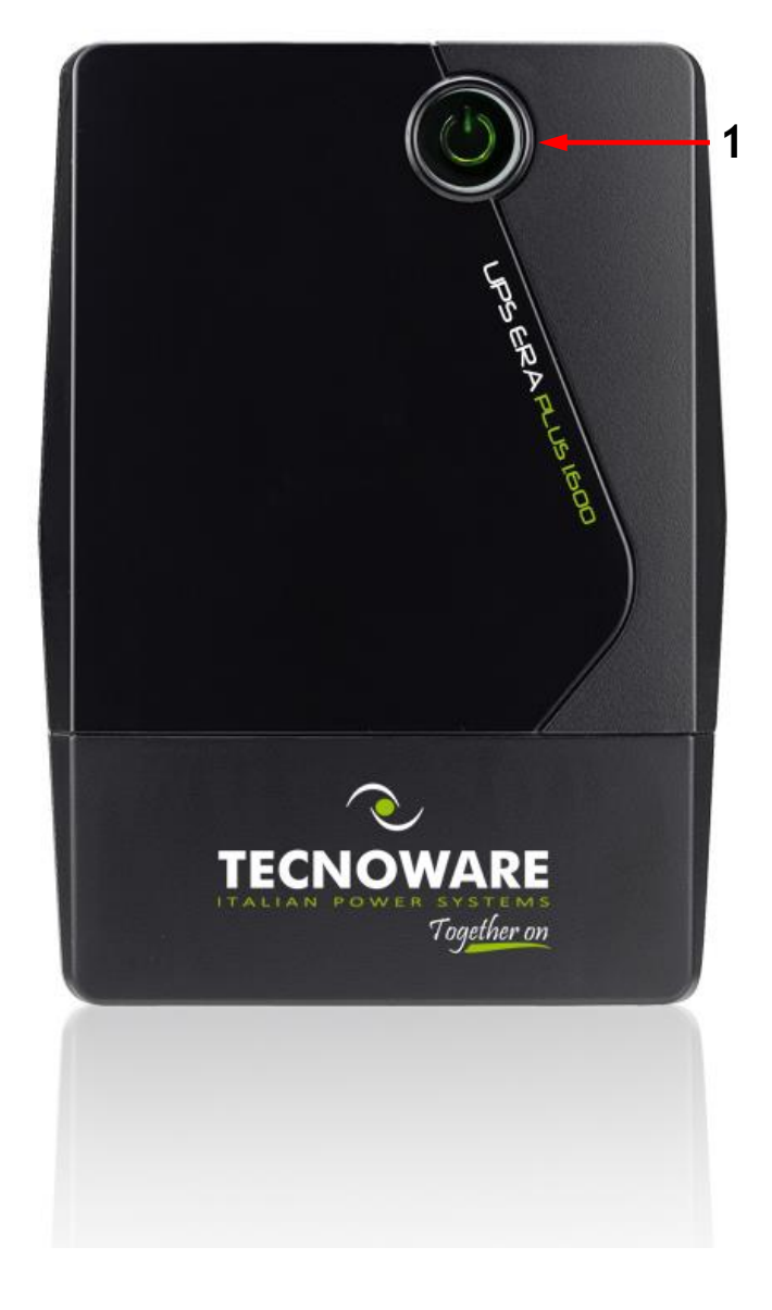
Figure 1 - Front panel

1. The ON/OFF button with LINE/BATTERY led enables the user to turn ON/OFF UPS and indicates with the led (green color) always active the functioning in Normal Mode, it flashes one time every 4 seconds in Battery mode and it flashes one time every second in Low Battery condition.