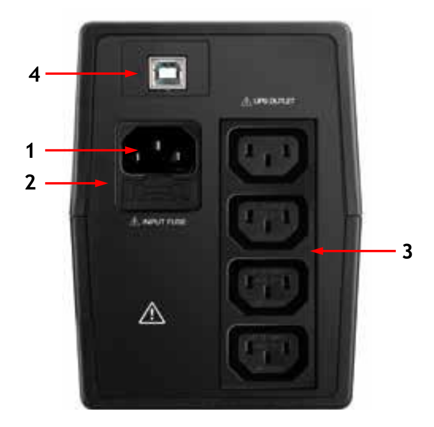
Figure 2 - Rear Side