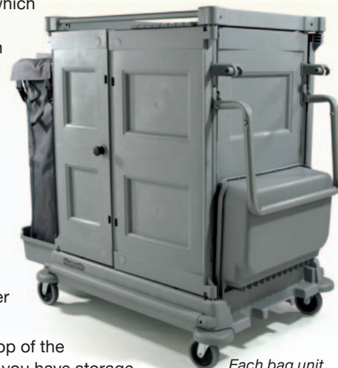
Each bag unit is easily foldable for compact storage.

The four door storage module is unique incorporating our full magnetic door system, no locks, no catches and easy access from both sides at all times. Take what you want and literally slam the door shut, couldn't be easier or quicker or tidier looking.