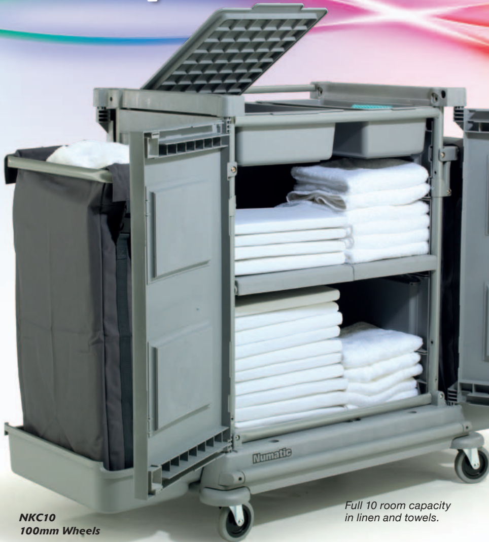
NKC10 100mm Wheels

In the top of the trolley you have storage trays for all those inevitable little bits and pieces. When doors and lids are closed you have a truly compact, clean and tidy looking professional housekeeper unit.