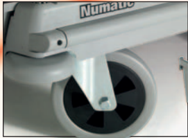
NKC-10AT 200mm Castor

The NuKeeper Compact AT model fitted with the 200mm soft ride castor option has many advantages where trolleys must be moved from building to building across open ground, along lengthy corridors, in and out of elevators or across raised thresholds in doorways.