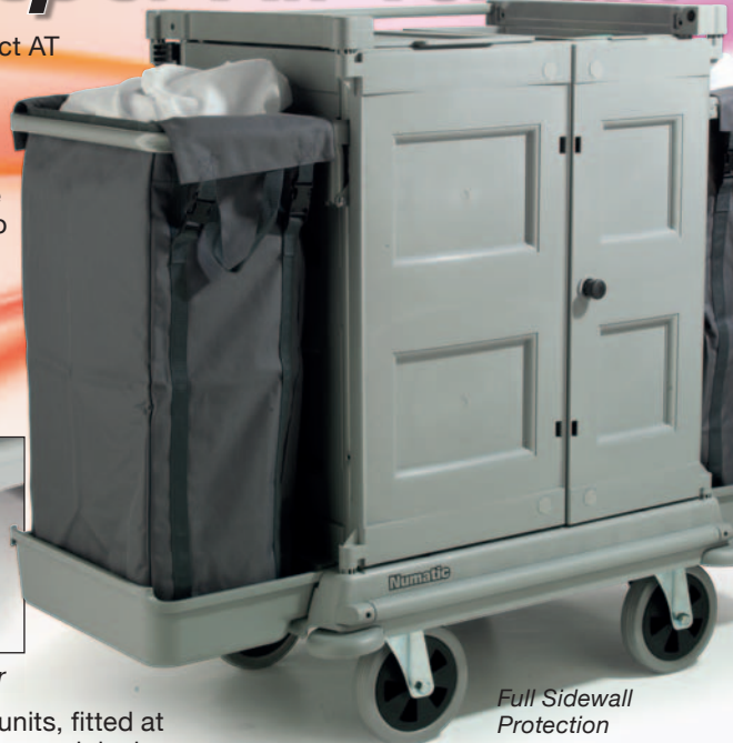
Full Sidewall Protection

The laundry linen bag units, fitted at each end, are of their own original design. First and foremost they are easy to remove with toggle fastenings; secondly the side flaps can be fastened across the top by the same toggles to close the bags and, thirdly, we have fitted dual drag handles to assist in movement of full bags.