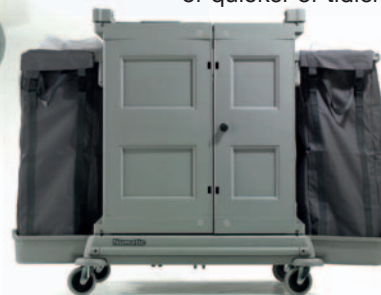
Twin 100-litre laundry bags.